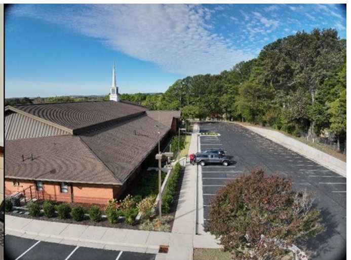
WG7V, KB7DLG, KK4KOW and N4DIX - Operating at the LDS Shelter on Sparkman Drive – 2025 SET