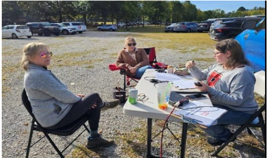
KD4RVV, K4MDE, and KN4MEW Operating from Sharon Johnston Park Distribution Center.

Huntsville Madison County ARES, Assistant Emergency Coordinator